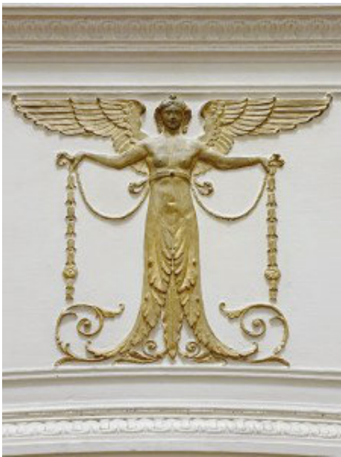
Ornament on the front of the Fremdenloge, formerly called Fürstenloge, in the Landestheater Detmold