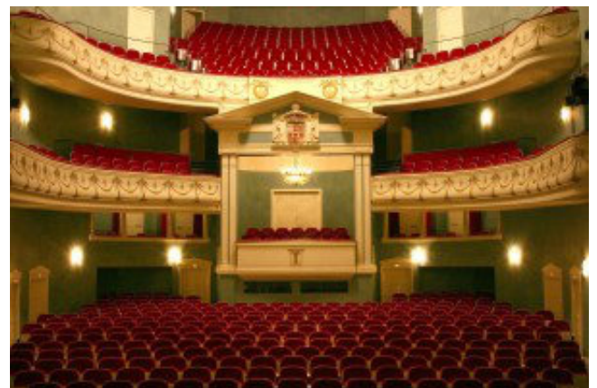
Landestheater Detmold, inside view

A sentence from her, that simply stems from deepest conviction and expression of her love for the privilege of what she is able to do professionally. And this sentence fell many times. She, the opera singer, is also an ardent opera fan herself. This was also confirmed by her husband